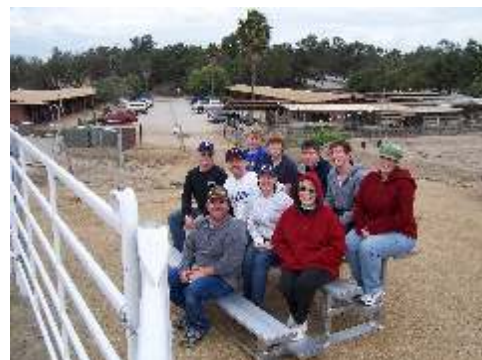
The crew, family and friends test out the new seating.

Students looking to bring their riding skills to a new level may now sign up for private lessons. For those who want to learn basic horsemanship from the ground up, we are offering lessons in grooming and tacking. For more information on these new and exciting classes, call the TRC office at (714) 848-0966.