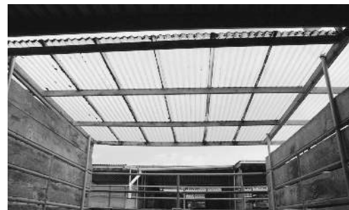
One of the completed stalls. Formerly, only the front of the stall had roofing. Now the entire stall is protected from the elements.